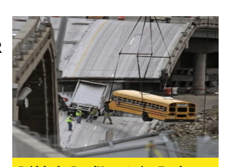
Paid for by RuralVotes Action Fund, a 501c4 rural issues advocacy organization, not authorized by any candidate or candidate's committee. Donations to Rural-Votes not tax deductible. Copyright 2008 all rights reserved. Produced in house.